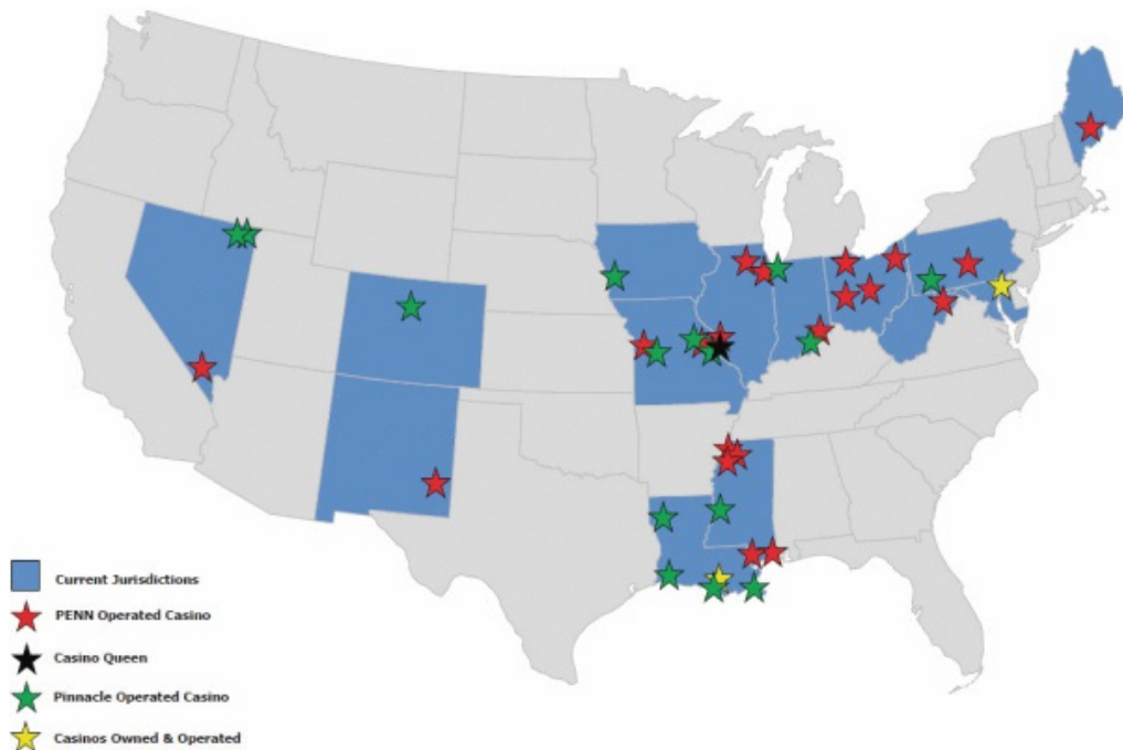
Map of Our Properties

As of December 31, 2017, our portfolio consisted of 38 gaming and related facilities. Our portfolio comprises approximately 15.4 million of property square footage and over 5,200 acres of owned and leased land and is broadly diversified by location across 14 states. Furthermore, we believe that these properties represent some of the top revenue-producing casinos in leading U.S. regional gaming markets.